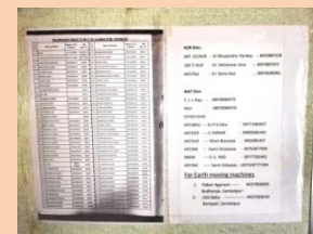
Telephone Number board