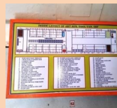
Layout board in Tool Van