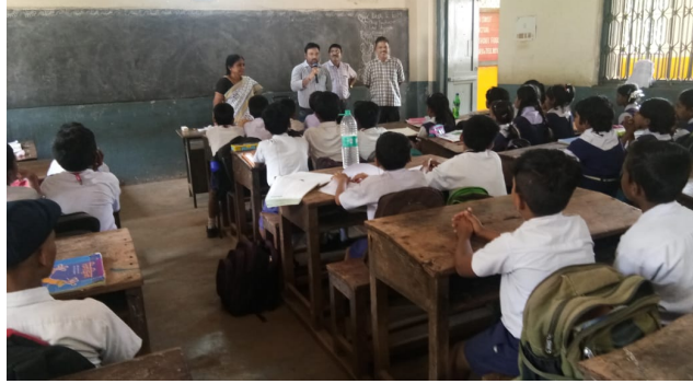
Swatcha samvad-MHSecondary school/KUR