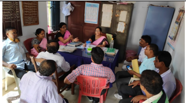
Interaction with Utkal Public School/BHC