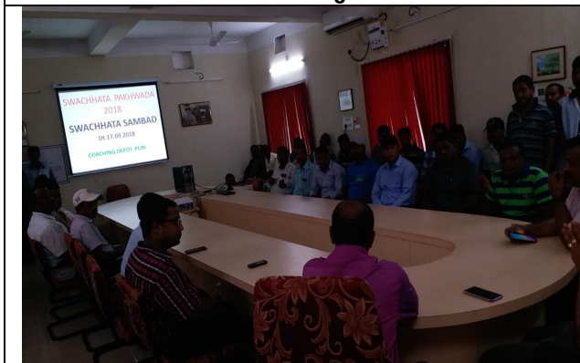
Swachh Samvad CD/PUI