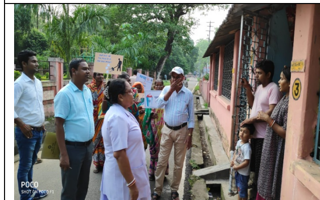
Interaction with Rly Colony/BHC