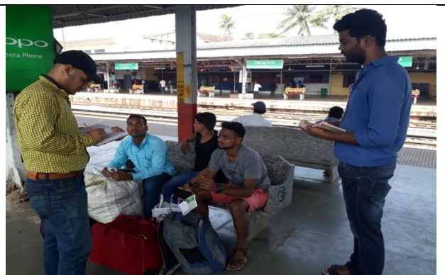
Interaction with passengers BAM