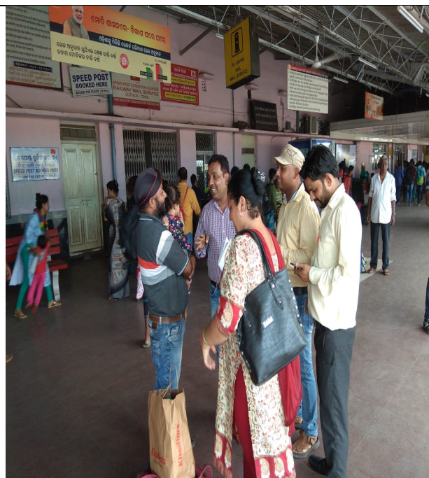
Interaction with passengers CTC