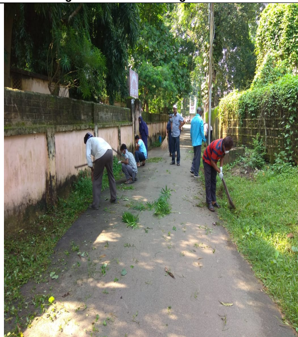
Cleaning at CTC