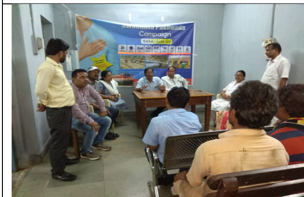
Swachh Samvad CTC