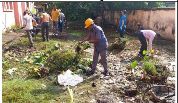
Cleaning Coaching Depot/PUI