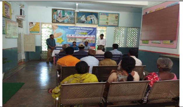
Swachh samvad/ PSA