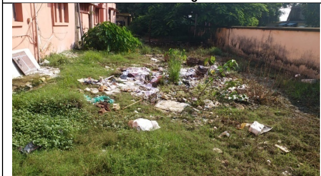
Before Cleaning CD/PUI