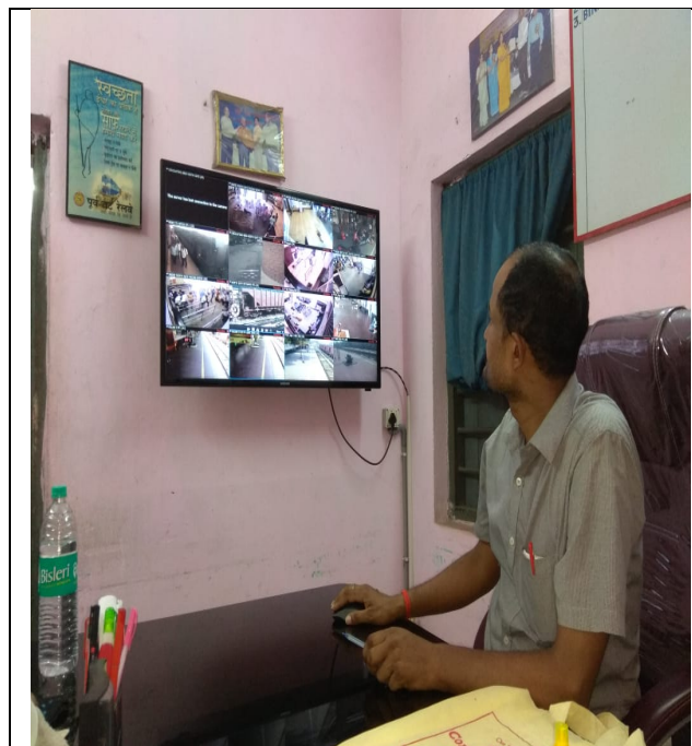
Monitoring Cleanliness through CCTV CTC station