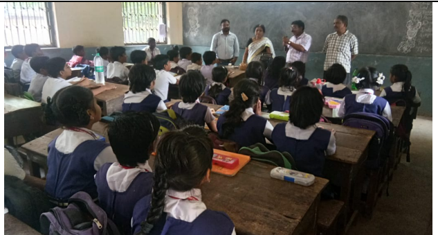
Swatcha samvad-MHSecondary school/KUR