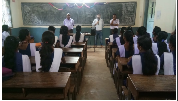
Swatcha samvad-MHSecondary school/KUR