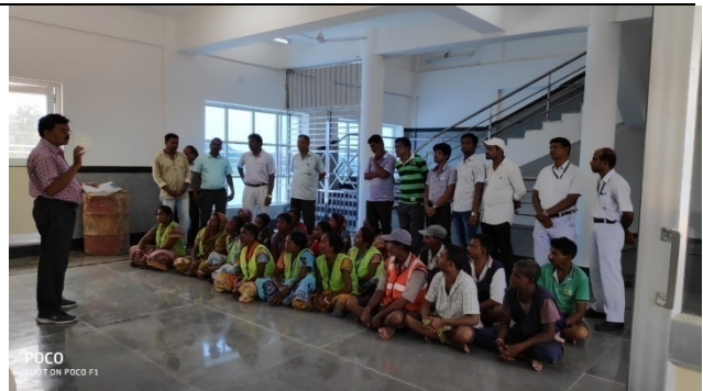
Swachh samvad BHC