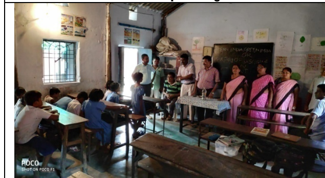
Interaction with Utkal Public School/BHC