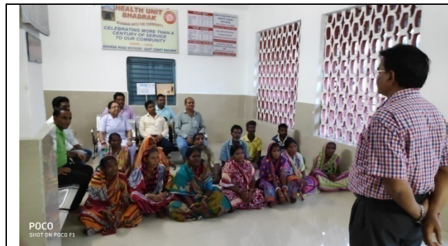
Swachh samvad BHC