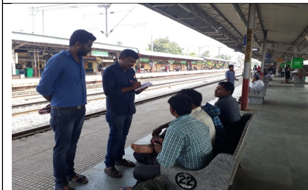
Interaction with passengers BAM