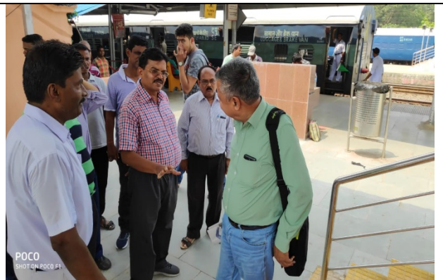
Interaction with passengers BHC