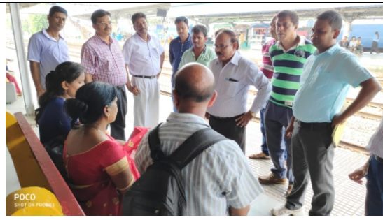
Interaction with passengers BHC