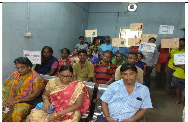
Swachh Samvad CTC