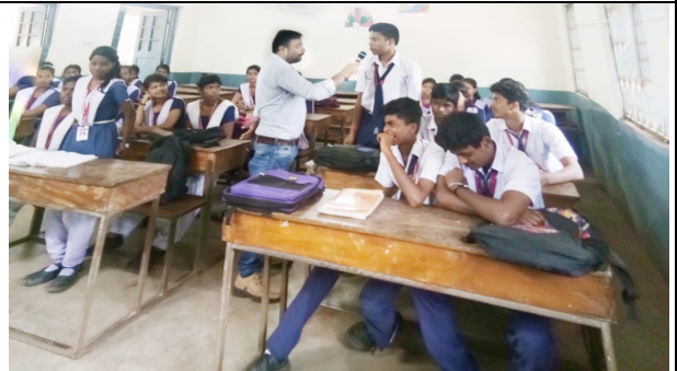
Swatcha samvad-MHSecondary school/KUR