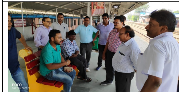
Interaction with passengers BHC